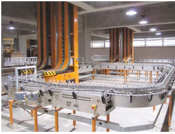
MSK bottle conveyors transport the glass containers to the palletisers.

start up, the machinery installed and commissioned by MSK has been functioning well and to the glassmaker's satisfaction.