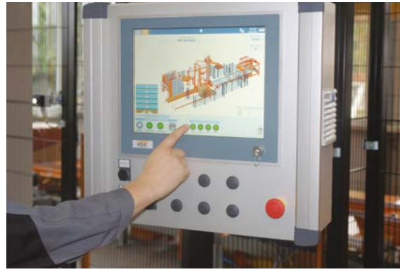
The intuitive MSK EMSY visualisation software makes machine operation easier.

system fastens the film far under the pallet base, so it ensures high load stability at reduced film thickness. The economical and reliable MSK Econotech secure shrink system heats the film gently with hot air, increasing the fatigue strength of the film, even in cases of long duration storage outdoors.