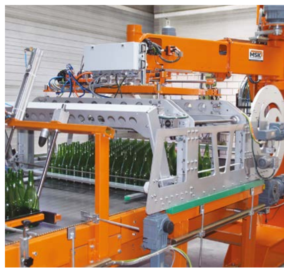
The universal palletiser from MSK flexibly processes a wide variety of bottles.

ZOUJAJ and MSK are already working together on the next project: As a result of the successful work together, in 2016 MSK will again be supplying cold end equipment with bottle conveyor and palletising systems for the original tank.